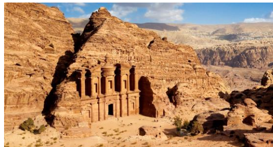
These ancient peoples who built their houses in mountains are thought by some to have been the people of Prophet Salih!