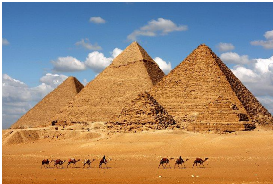
These tombs were built by slaves under the rule of pharaohs

Try and identify where in the world these images are taken from!