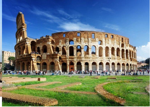
This colosseum was built centuries ago by an empire which spanned over five million kilometres at its peak