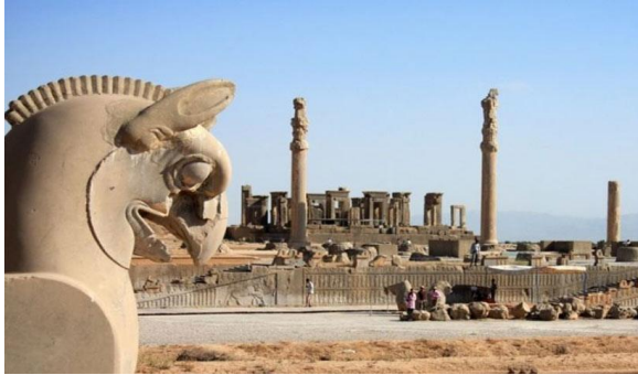
The city's remote location kept it a secret from the outside world, and it became the safest city in the empire