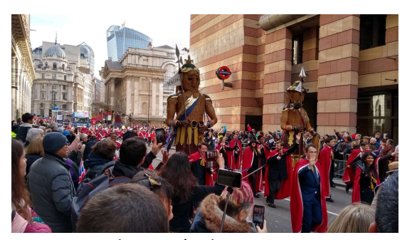
Lord Mayor's Show 2019

Gog and Magog (Yajuj and Majuj). Visit: <a href="https://lordmayorsshow.london/history/gog-and-magog">https://lordmayorsshow.london/history/gog-and-magog</a>